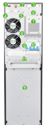
10 kVA (S)