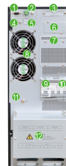
15/20 kVA (H)